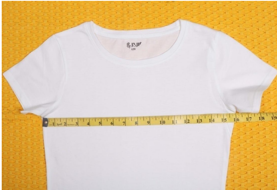
Half chest Measurement illustration